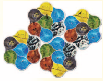
2 players : 4 tiles