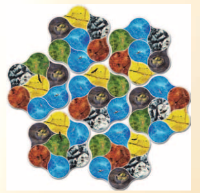
4 players : 7 tiles